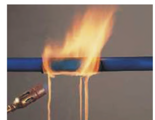
Other Plastics - initially when torch is applied