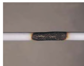
CPVC - After torch is removed